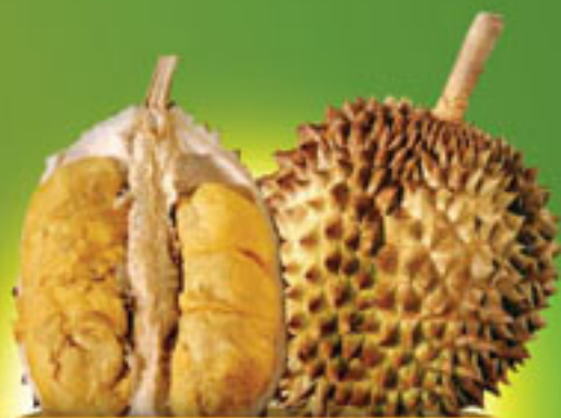
PENANG 15 D 177