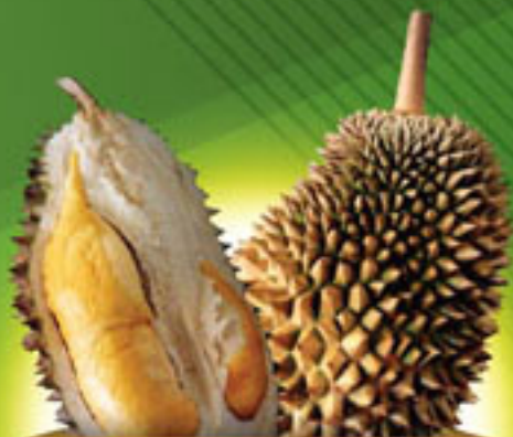
LABU D 163