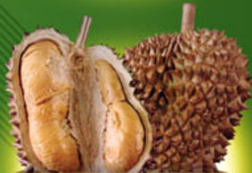
ISI MERAH D 164 (ANG BAKI)