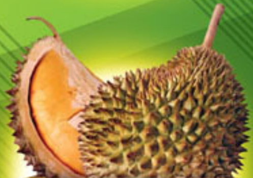
HATI MERAH (ANG JIN)