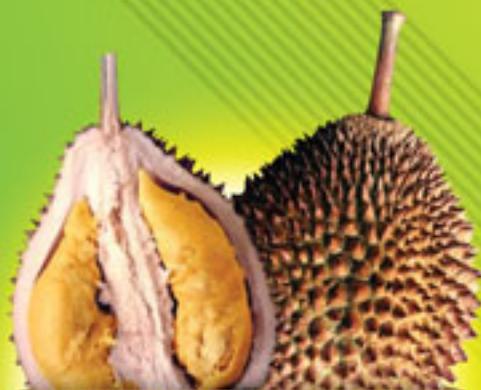
UDANG MERAH D 175 (ANG HAE)